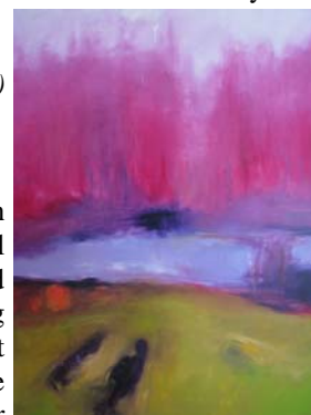
Original Oil on Linen 2010 (48w x 72h) "Lake Edge Spring" Value $3,000; minimum bid $1,000